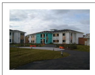
ST ANDREWS HEALTHCARE DOGPOOL LANE

These included workshops, leisure areas a laundrette, plus bedrooms with en suite shower facili-