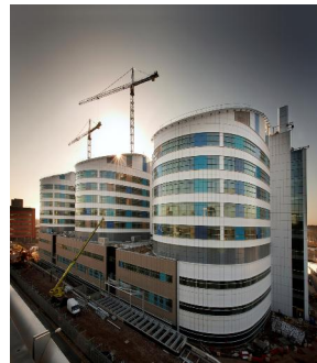
RE-DEVELOPMENT QUEEN ELIZABETH