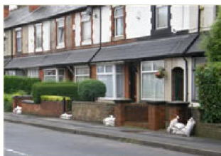
Sand bags on Ripple road