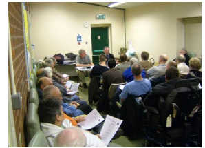
Stirchley Neighbourhood Forum Meeting Monday 9th February